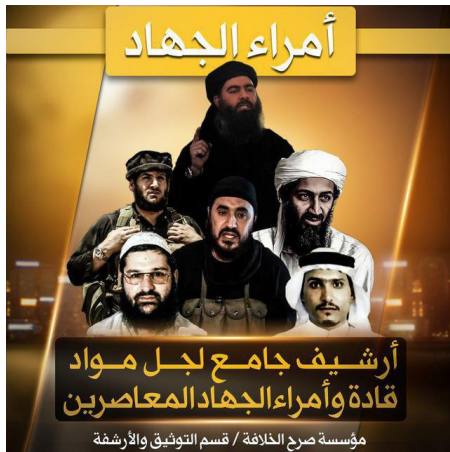
Banner for the above-mentioned archive

- Links for downloading a comprehensive archive with audio, video, transcripts etc. published by jihad leaders, including Osama Bin Laden, Abu Masab Al Zarqawi, Abu Bakr Al Baghdadi and more