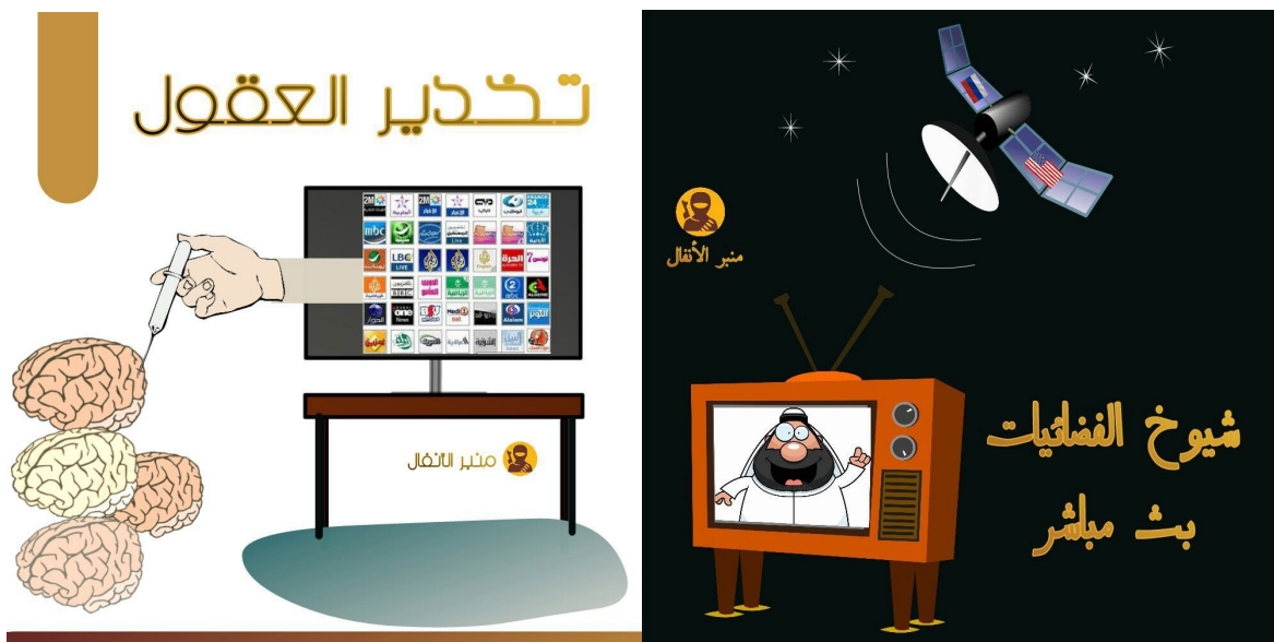
Left to Right: "The Sheikhs of Satellite Channels: Direct Broadcast"; "Paralysis of the Mind"